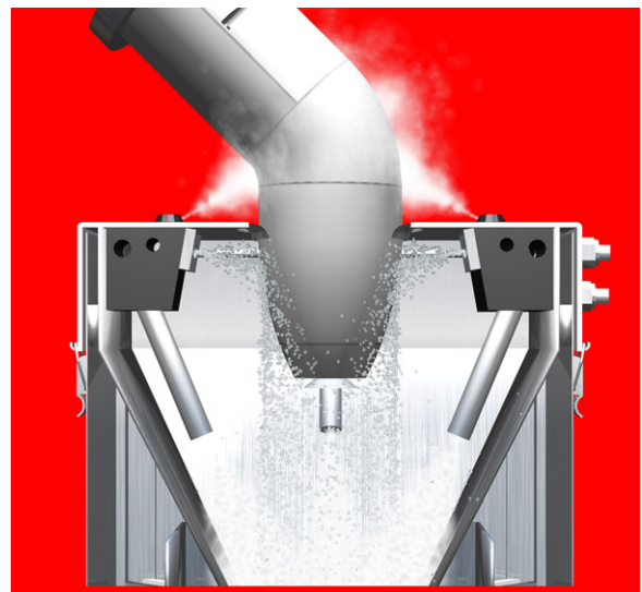
The Applicator Cleaner cleaning a bell-type atomizer.